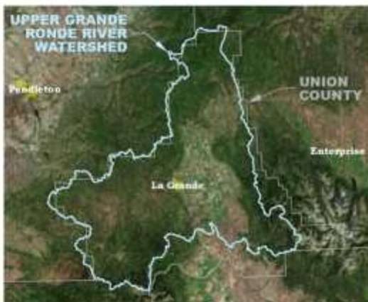
Figure 1 - Location Map

The scope of planning will include the entire Watershed, also known as the Upper Grande Ronde River Subbasin (HUC 17060104) (which approximately matches the boundary of Union County), see Figure 1. The Watershed encompasses nearly 1,640 square miles in northeastern Oregon. To facilitate the scoping of this project, Appendix A, Memorandum of Understanding (MOU), describes the roles and responsibilities of Partners, Appendix B, List of Current Partners, and Appendix C includes Exhibit A - Budget and Exhibit B - Statement of Work for Planning, Step 1 from the OWRD Grant Agreement. This Agreement describes the scope of the effort in terms of Partnership