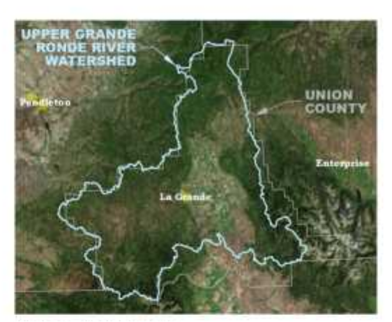
Figure 1 - Location Map

The scope of planning will include the entire Watershed, also known as the Upper Grande Ronde River Subbasin (HUC 17060104) (which approximately matches the boundary of Union County), see Figure 1. The Watershed encompasses nearly 1,640 square miles in northeastern Oregon. To facilitate the scoping of this project, Appendix A, Memorandum of Understanding (MOU), describes the roles and responsibilities of Partners, Appendix B, List of Current Partners, and Appendix C includes Exhibit A - Budget and Exhibit B - Statement of Work for Planning, Step 1 from the OWRD Grant Agreement. This Agreement describes the scope of the effort in terms of Partnership